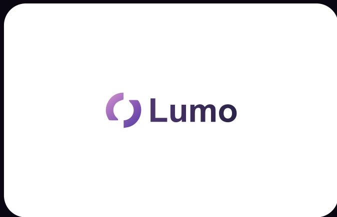
PRIMARY · FULL COLOR · #FFFFFF