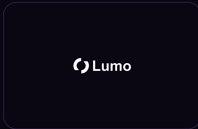
WHITE · REVERSED · #0A0612